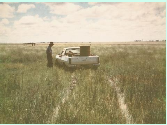
Mitchell grasslands in Central-Western Queensland, Australia, and resilience: