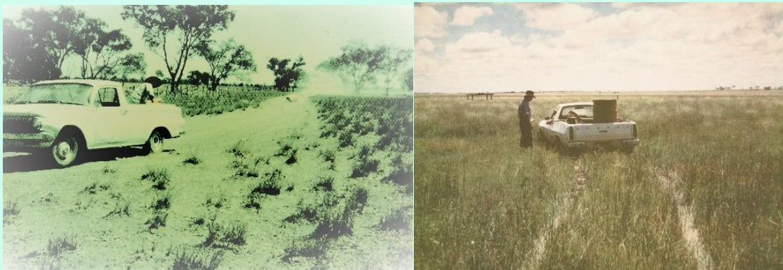
Mitchell grasslands in Central-Western Queensland, Australia, and resilience:

Ted's professional career and interests in sustainability and resilience commenced whilst living and employed in the semiarid rangelands of Australia's pastoral zone – over a 11-year period encompassing prolonged drought and "good seasons"- as illustrated in the following photos of his natural grassland research sites In Australia's pastoral zone.