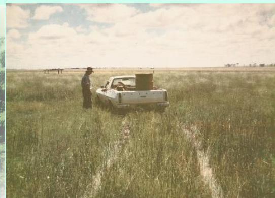
Mitchell grasslands in Central-Western Queensland, Australia, and resilience: